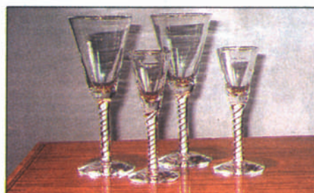
Jacobite Twist Glasses

T ake the high road or the low road and find an array of Scottish luxury goods for the home at www.thistleandbroom.com . Thistle & Broom, a new company based in Edinburgh, Scotland, offers a collection of one-of-a-kind fine art, crafts, decorative home items, furniture, clothing and jewelry, all made exclusively in Scotland by Scottish artisans.