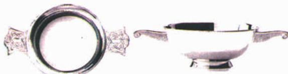
The Quaich Collection